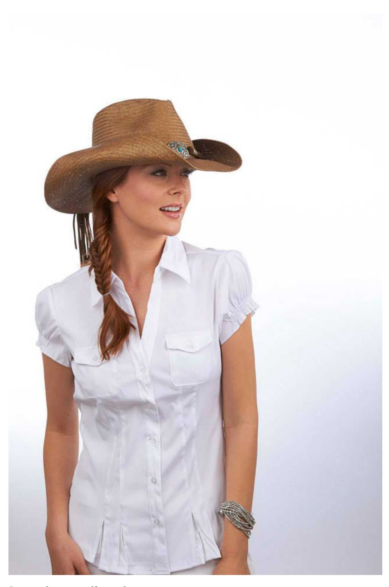
So you play yourself exactly.